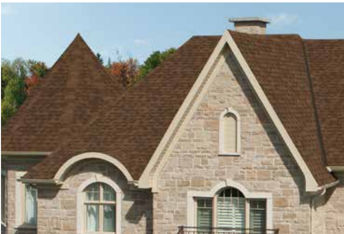
Colour featured: Dual Brown