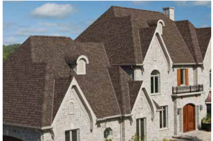
Colour featured: Driftwood