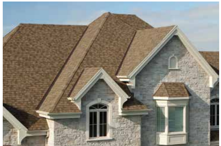
Colour featured: Weatherwood