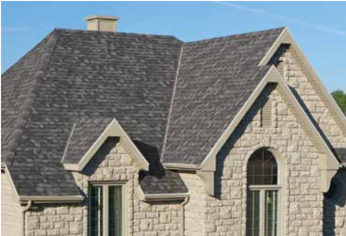
Colour featured: Slate